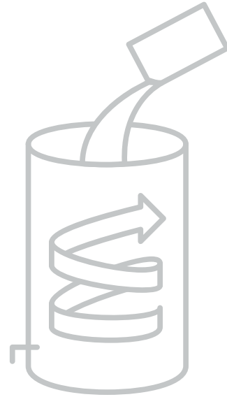
Pour WildBrew Sour Pitch™ into unhopped wort